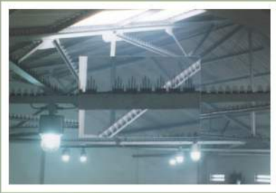
ONE OF THE SUCCESSFUL SITE

PIGEON SPIKE is very latest in technology which covers all the plus points compared with conventional method. Our research team and knowledgeable consultant have developed the technology for keeping the thought of ultra modern age. The method is widely accepted & performing successfully.